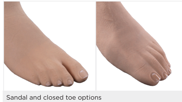
Sandal and closed toe options