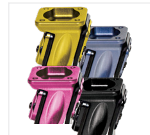
Alternate housing options available: Gold, Silver, Perfect Pink, Midnight Black.