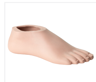
Solid toe foot shell

Note: Please see the following page for Soleus spare parts ordering information.