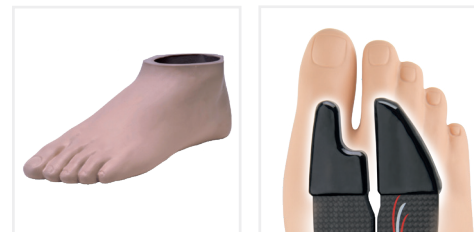
Mid profile foot shell Sandal toe only